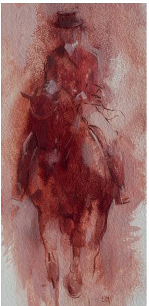
Rouge Dressage II Oil on paper • 13.75 x 6.75 ins