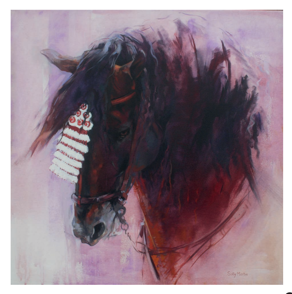
Dark Andalusian Oil over acrylic 32 x 32 ins

Andalusian glance I Oil on paper 28.5 x 17.5 ins