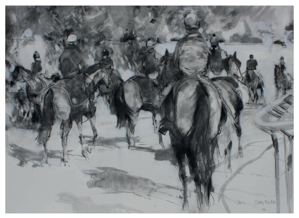
Newmarket heartbeat Mixed media 28 x 40 ins