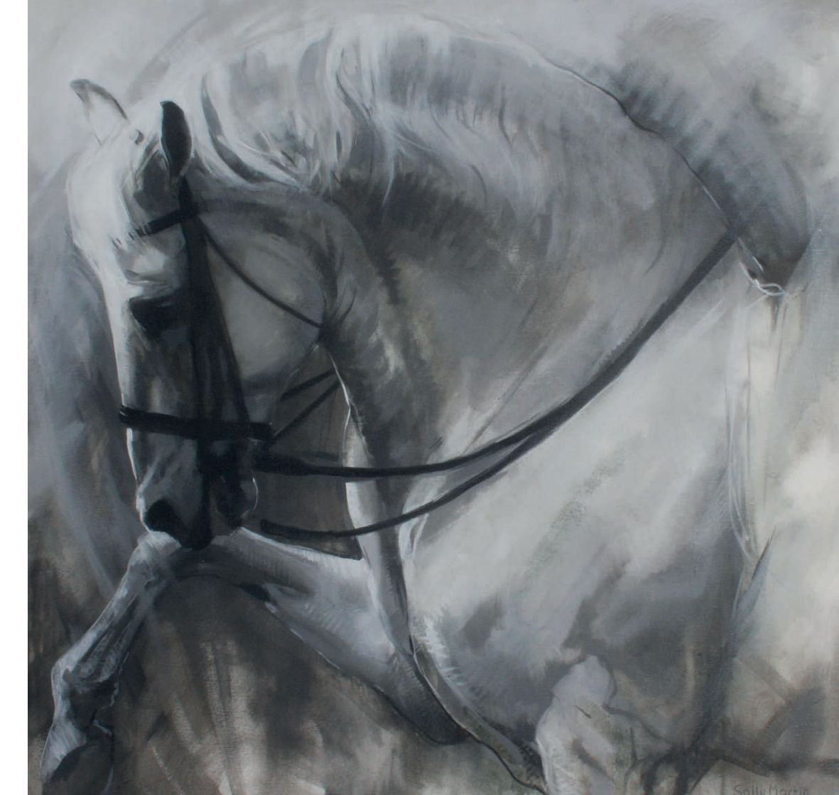
Farolero Oil over acrylic 36 x 36 ins