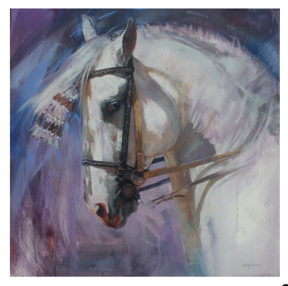
Grey Andalusian I Oil over acrylic 32 x 32 ins

Electric Andalusian III Oil over acrylic 39 x 24 ins