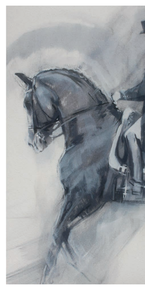
Dressage essence – pirouette monochrome triptych Mixed media 14.5 \times 9.5 ins each