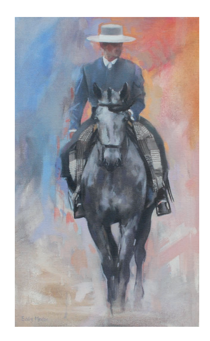
Spanish elegance III Oil over acrylic 20 x 12 ins