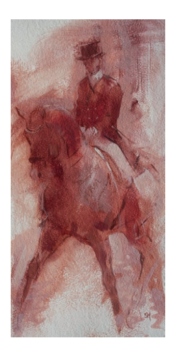
Rouge Dressage III Oil on paper • 13.75 x 6.75 ins