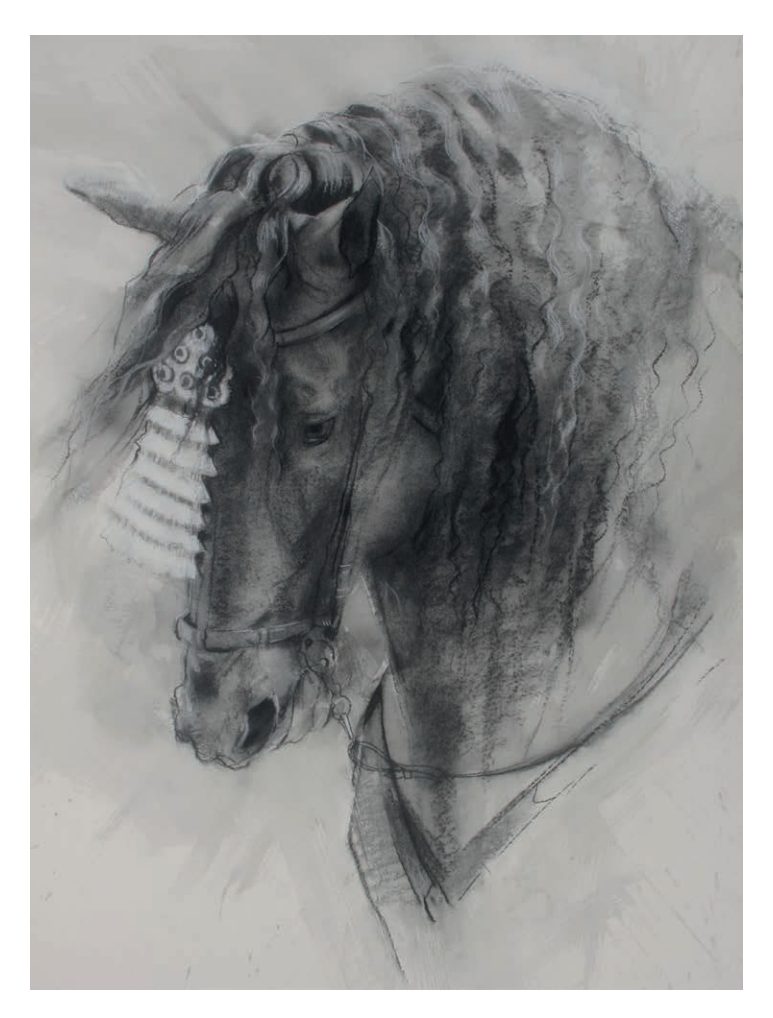
Dark Andalusian -monochrome Mixed media 39.5 x 28.75 ins