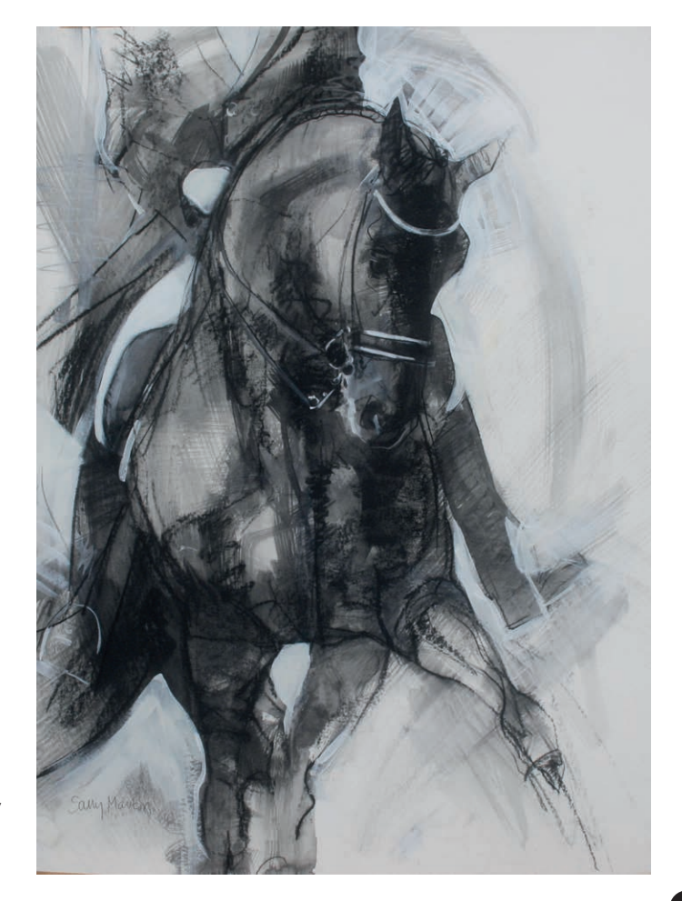
Dressage essence – totilas memory Mixed media 29 \times 20.75 ins

Dressage essence – half pass Mixed media 20 x 13.5 ins