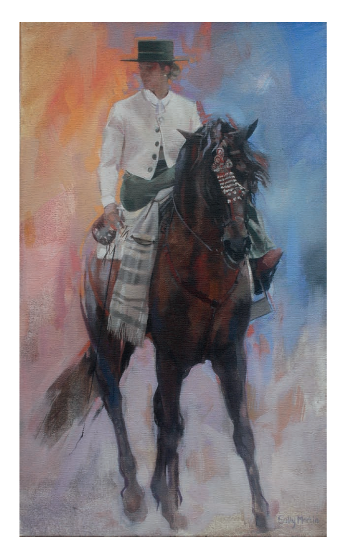
Spanish elegance IV Oil over acrylic 20 x 12 ins