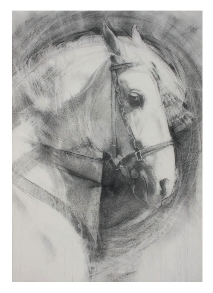
Grey Andalusian – monochrome Mixed media 39.5 x 28.25 ins

Spanish elegance III – monochrome Mixed media 20.75 x 12 ins