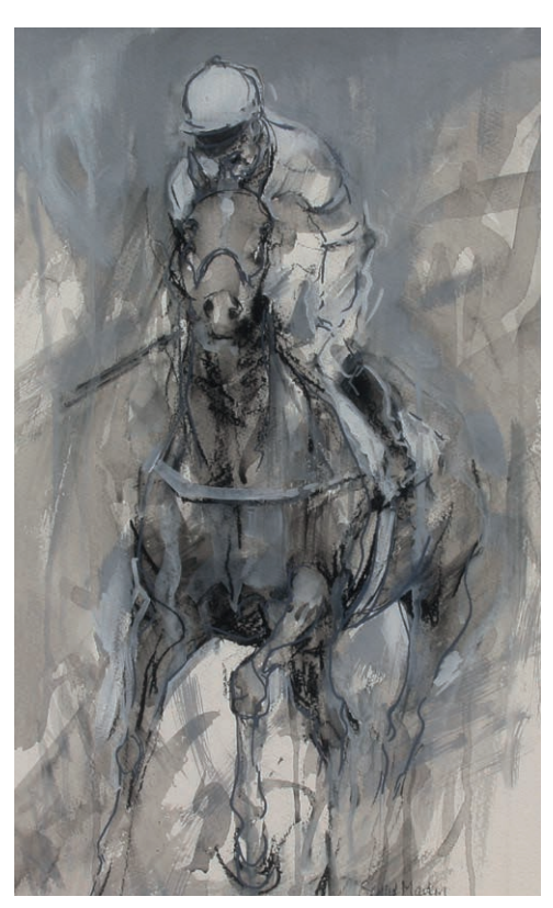
Cantering up – study Mixed media on paper 19.75 x 12.75 ins