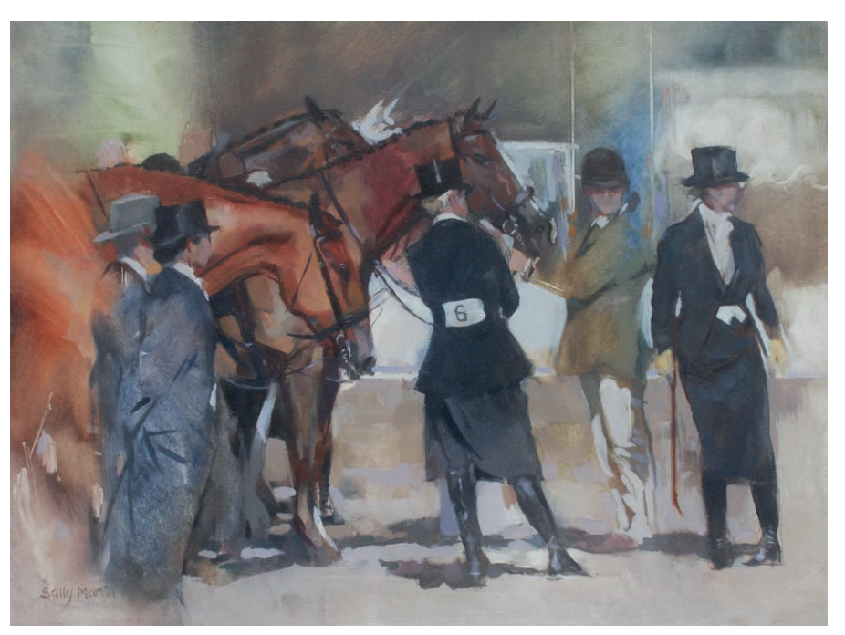
Sidesaddle class – interlude Oil on board 9 x 12 ins