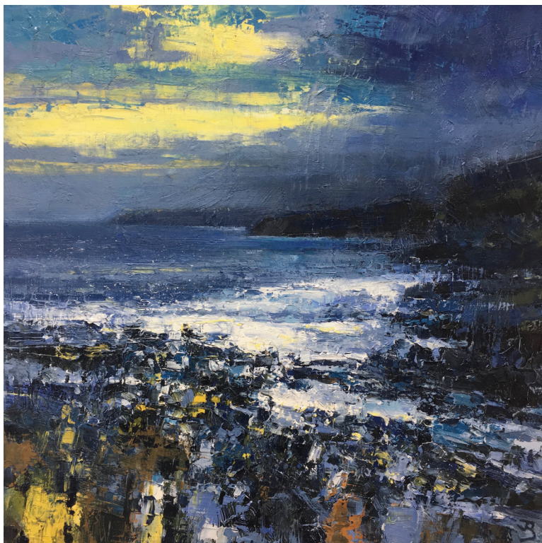
Cornish foreshore at twilight

oil on canvas • 16 x 16 ins (40.5 x 40.5 cm) • £1250.00