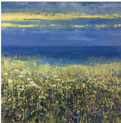
Campion and cowparsley on the coast oil on board • 14 x 14 ins (35.5 x 35.5 cm) • £95000

PAINTINGS ARE FOR SALE ON RECEIPT OF THIS INVITATION.