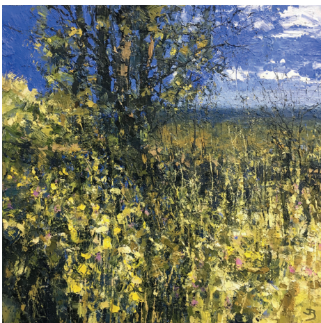
Chipping Campden hedgerow oil on board • 12 x 12 ins (30.5 x 30.5 cm) • £75000