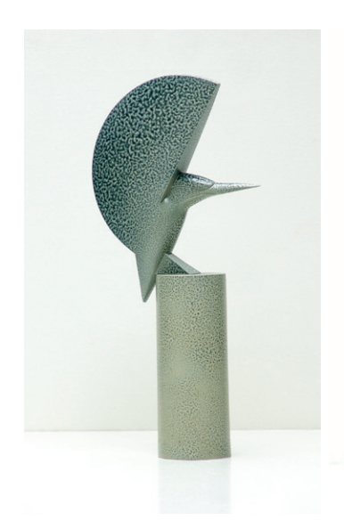
'Kingfisher' Ceramic • 35cm h • £490