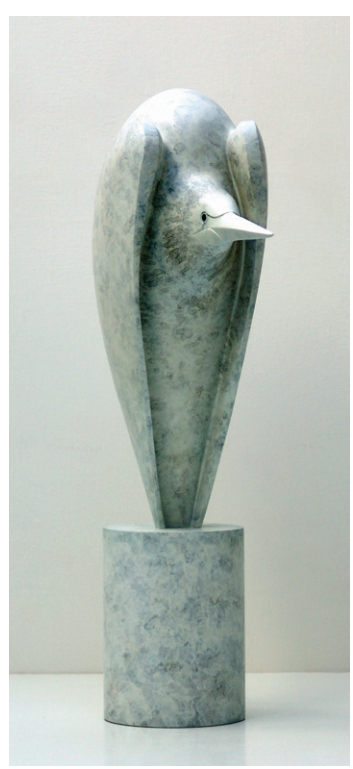
edtion of 12