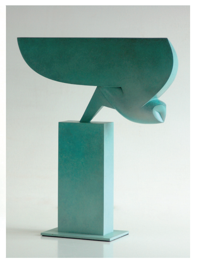
'Stealth' Barn Owl edtion of 12 Bronze • 39cm h • £4600