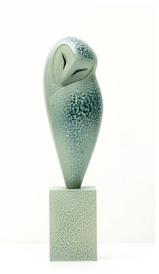
'Peaceful' Ceramic • 30cm h • £490