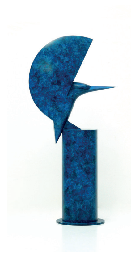
Kingfisher edtion of 12 Bronze• 37cm h•£3200