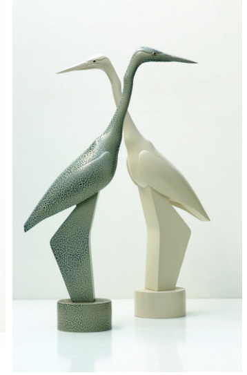
'Tall Heron' Ceramic • 46cm h • £790