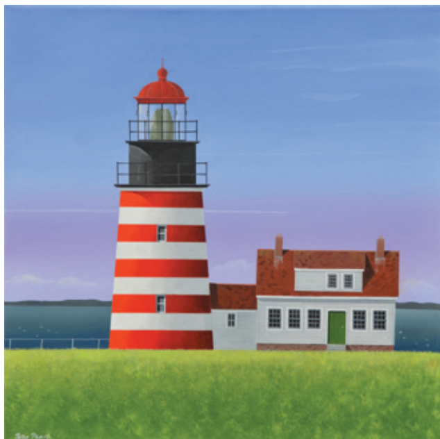
West Quoddy Head • 20 x 20 ins (50 x 50 cms)