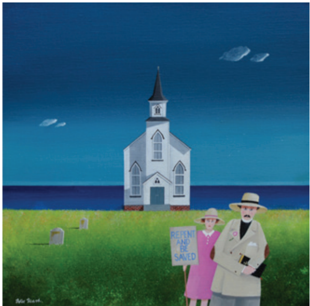
Preacher 20 x 20 ins (50 x 50 cms)