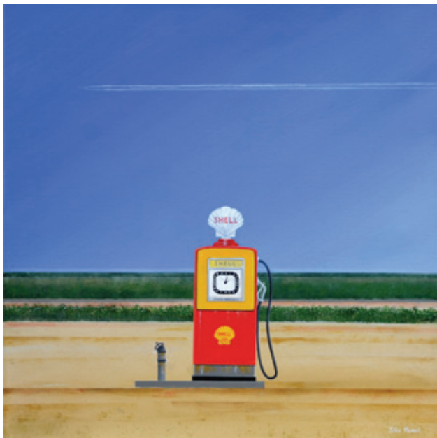
Outback lighthouse • 20 x 20 ins (50 x 50 cms)