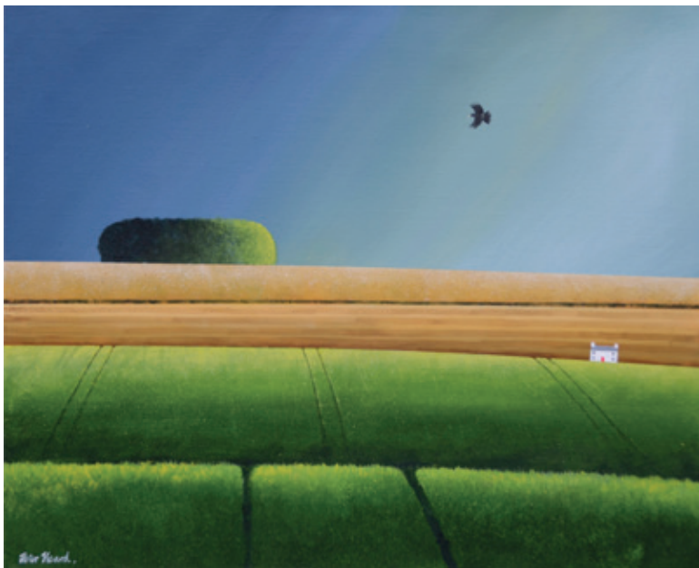
Crow • 20 x 23.5 ins (50 x 60 cms)