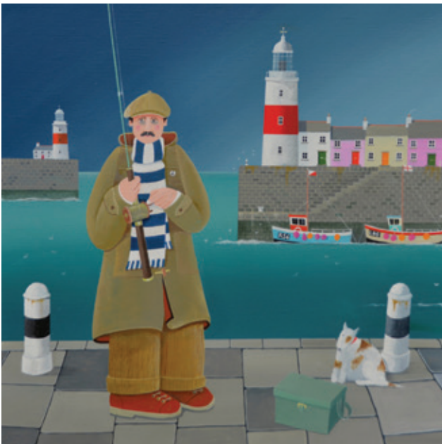
One on! 20 x 20 ins (50 x 50 cms)