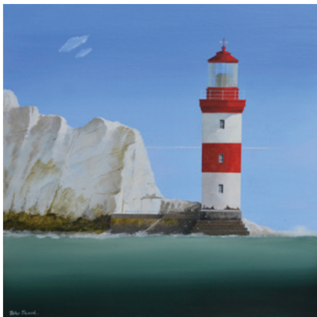
The Needles • 20 x 20 ins (50 x 50 cms)