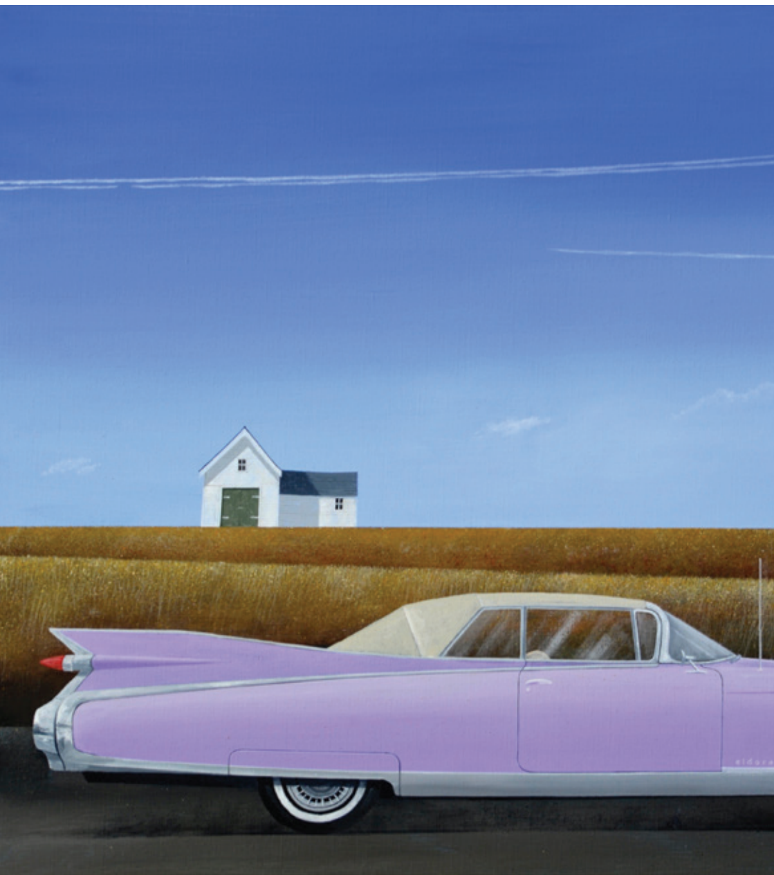
Eldorado • 25.5 x 31.5 ins (65 x 80 cms)