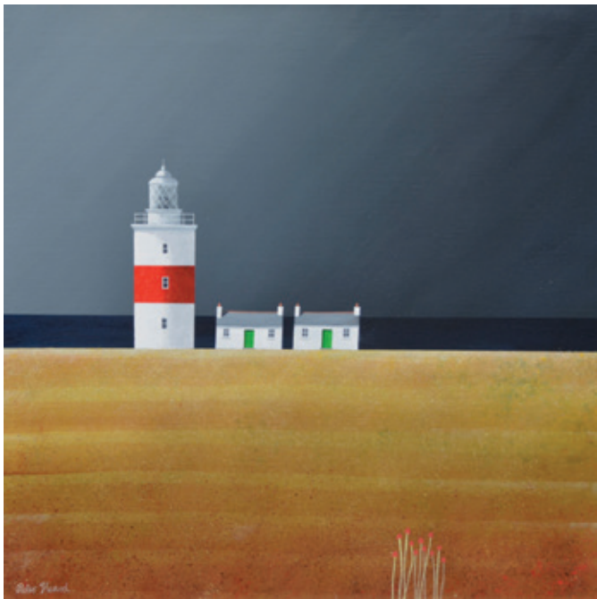
Lighthouse station 20 x 20 ins (50 x 50 cms)