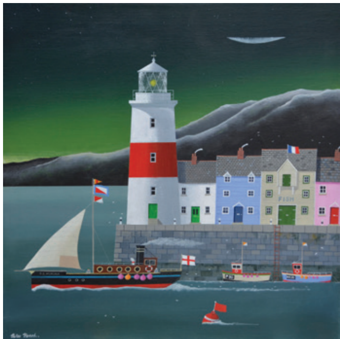
Aurora 20 x 20 ins (50 x 50 cms)