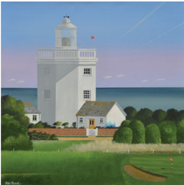
OB at Cromer 20 x 20 ins (50 x 50 cms)