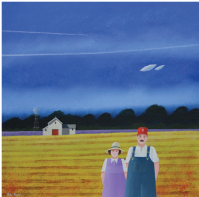
Trump voters 20 x 20 ins (50 x 50 cms)