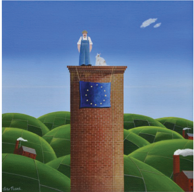
Fred 16 x 16 ins (40 x 40 cms)