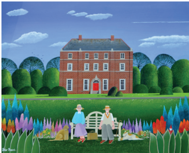
National Trusting • 20 x 23.5 ins (50 x 60 cms)