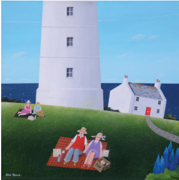
Picnics 20 x 20 ins (50 x 50 cms)