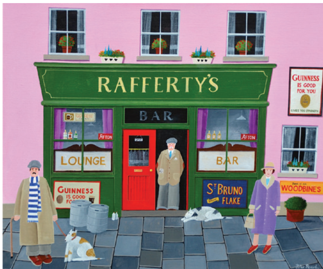
Rafferty's bar 20 x 23.5 ins (50 x 60 cms)