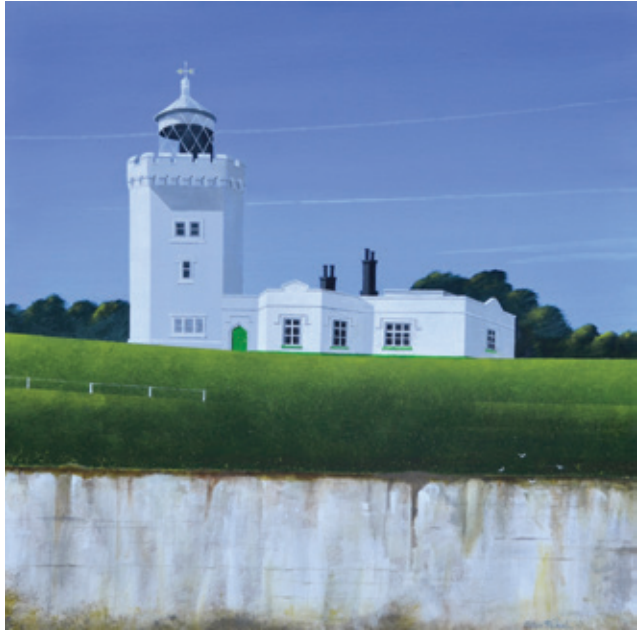
South foreland 20 x 20 ins (50 x 50 cms)