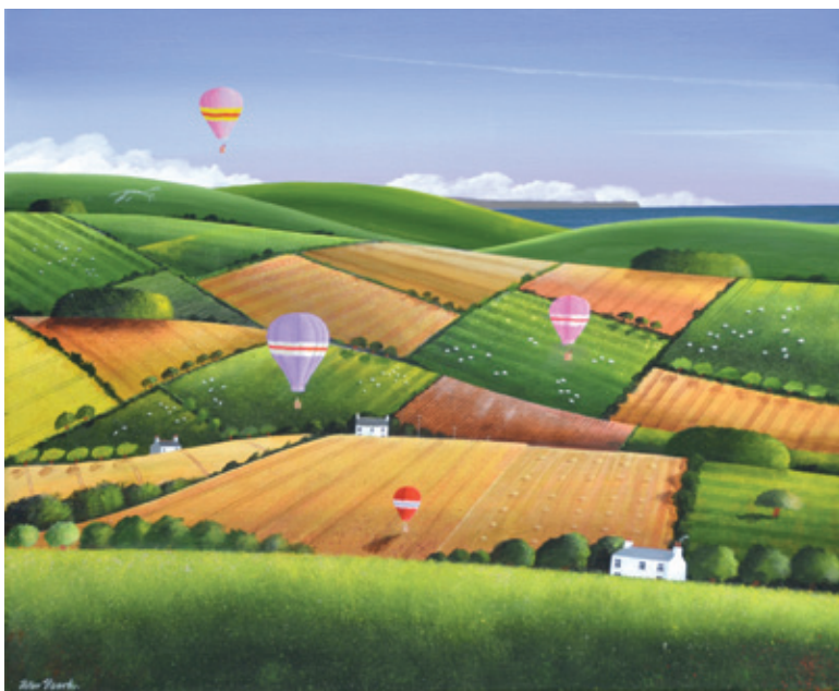
White Horse Vale • 20 x 23.5 ins (50 x 60 cms)