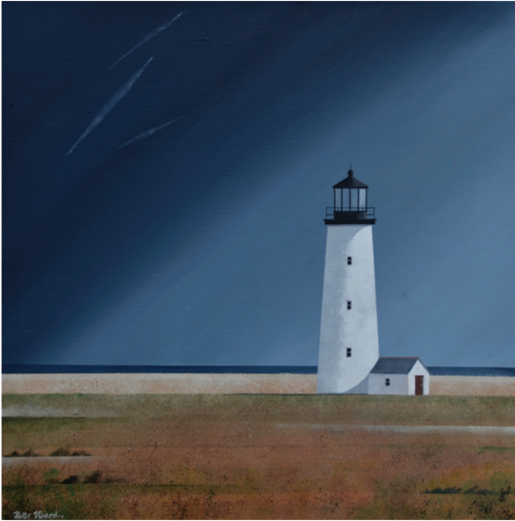
Nantucket light • 20 x 20 ins (50 x 50 cms)