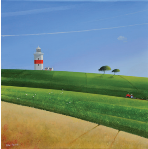
Daymark 20 x 23.5 ins (50 x 60 cms)