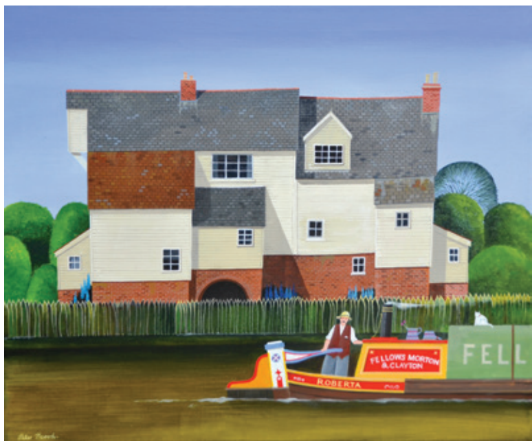
Stour mill • 20 x 23.5 ins (50 x 60 cms)